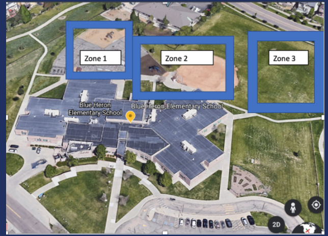
• Recess Zone Map

Students will remain in their cohorts by playing in assigned daily zones. We will teach active and engaging games that include safe social distancing measures so students can take their masks off. In addition, we will provide a variety of playground equipment for students (i.e. jump ropes, hula hoops, basketballs for HORSE, frisbees, etc.) all items will be sanitized after each cohort.